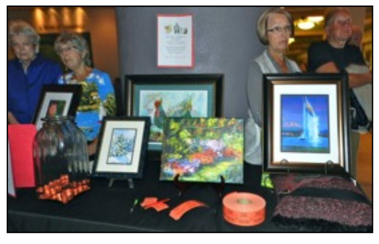
Raffle Proceeds for Schools