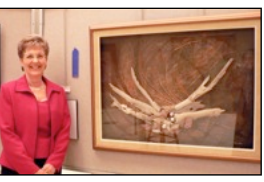
The name of this mixed media painting is "Tucked In."