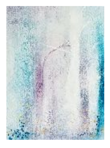
*conte de fée*