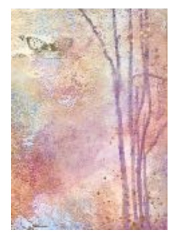
*whisper* was recently published in Brush Magazine

Splatter with diluted white, gold, or black acrylic paint.