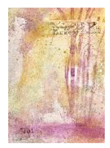
*joyeux* was recently published in Brush Magazine