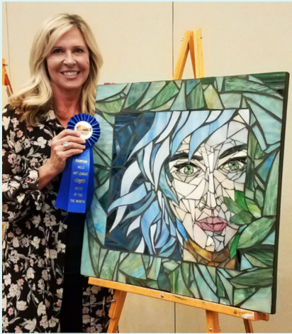
“Shattered But Not Broken”