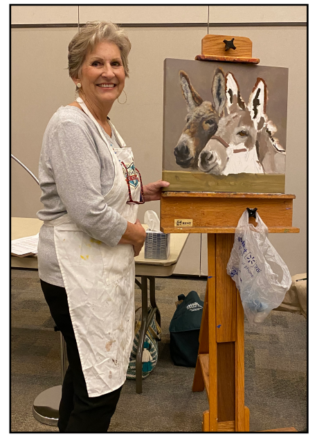
Juried show AL Winners