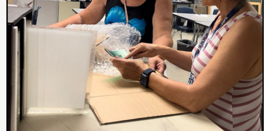
The Fountain Hills High School Art Department was given over 90 pounds of stained glass.

The Fountain Middle School Art Department received acrylic paints and 125 pounds of air-dry clay.